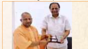
Sh. Yogi Adityanath, Chief minister of Uttar Pradesh