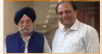
Sh. Hardeep Singh Puri Minister of Petroleum & Natural Gas, Housing & Urban Affairs