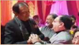
Sh. JP Naddha, President of Bhartiya Janta Party