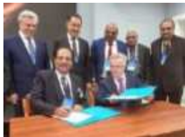
Signing MOU with Financial & Business Association of Euro-Asian Cooperation Russia