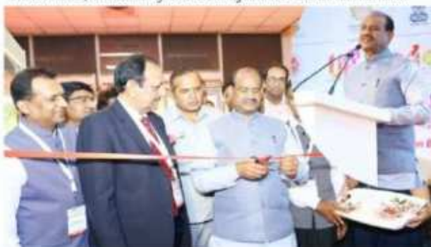
Sh. Om Birla, Speaker of Indian Parliament