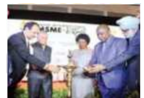
Gen. V.K. Singh MOS Civil Aviation with MSME Minister of Zimbabwe & Ambassador of Zimbabwe