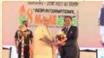
Sh. Manoj Sinha Jammu & Kashmir Lieutenant Governor