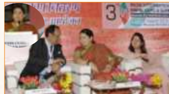
Smt. Smriti Irani, Minister of women & Child Development addressing the Expo-Summit