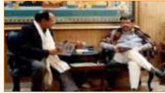
Sh. Dharmendra Pradhan, Union Minister of Education, Skill Development & Entrepreneurship