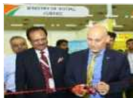
Ambassador of Israel