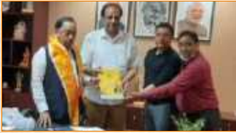
Sh. Narayan Rane, Union Minister of MSME