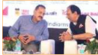
Dr. Jitender Singh Union Minister (MOS) Prime Ministers Office (PMO)