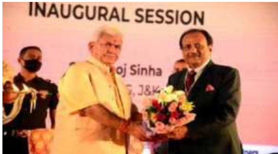
Sh. Manoj Sinha, Lieutenant Governor of Jammu & Kashmir