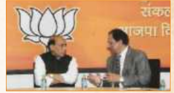
Sh. Rajnath Singh, Union Defence Minister