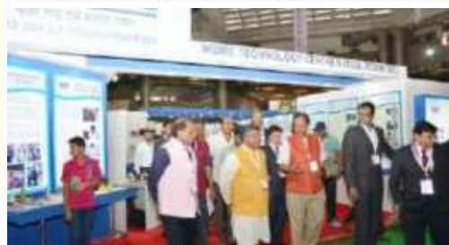
Shri Ravi Shankar Prasad, Union Electronic & IT Minister