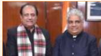
Sh. Bhupender Yadav Union Cabinet Minister for Environment, Forest & Climate Change; and Labour & Employment