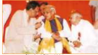
Sh. Atal Bihari Vajpayee Former Prime Minister of India