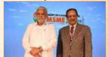
Sh. Parshottam Rupala Union Minister of Animal Husbandry, Dairying and Fisheries