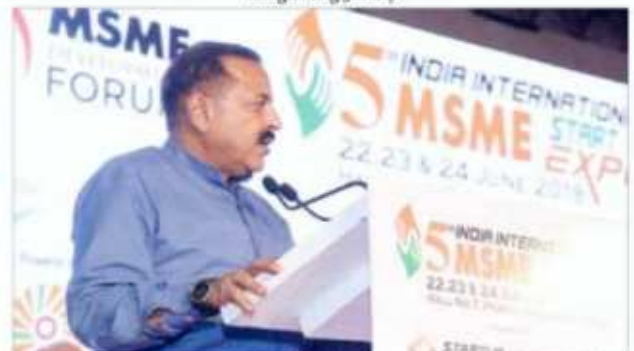
Dr. Jitender Singh, Union Minister (MSO) Prime Minister Office (PMO) & DONAR