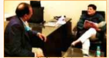
Sh. Piyush Goel, Union Minister of Commerce, Industry, Textiles & Consumer Affairs