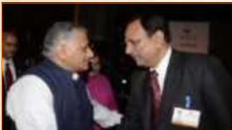
General Vijay Kumar Singh, Union Minister (MSO), Ministry of Road Transport and Highways