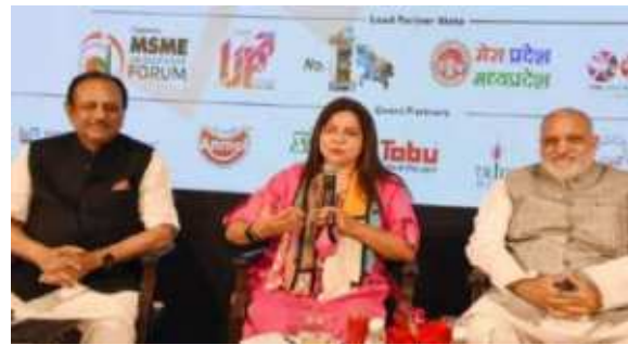
Smt. Meenakshi Lekhi, Minister of State for External Affairs and Culture