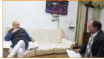
Sh. Amit Shah Union Home Minister, Minister of Cooperation and MP