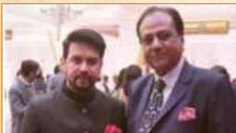
Sh. Anurag Thakur, Union Minister of I&B, Youth Affair & Sports