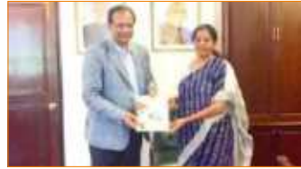
Smt. Nirmala Sitharaman, Union Finance Minister