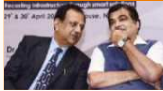
Sh. Nitin Gadkari, Union Minister of Road Transport & Highways