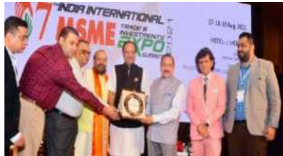
Dr. Jitender Singh Union Minister (MOS) Prime Ministers Office (PMO)