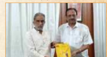
Shri Krishan Pal Gurjar, MOS-Heavy Industries & Public Enterprises & Power