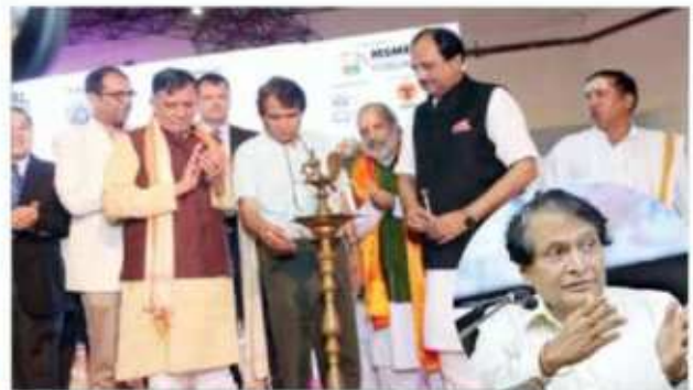
Sh. Suresh Prabhu, Union Minister of Railways, Commerce & Industry with Sh. Satish Mahana, Industry Minister, U.P & Sh. Jai Bhagwan Goel Inaugurating 5th Expo