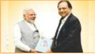
Sh. Narendra Modi Prime Minister of India