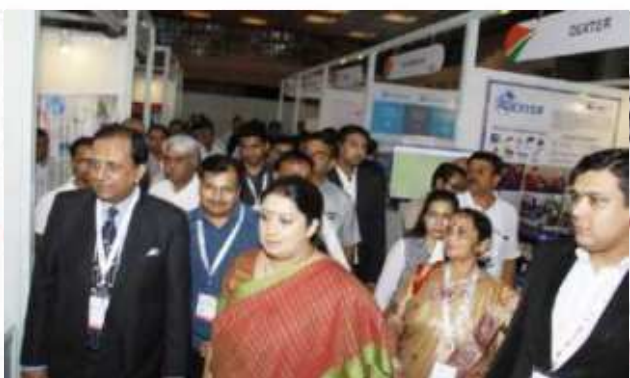
Smt. Smriti Irani Ministry of Woman & Child Development Ministry of Minority Affairs